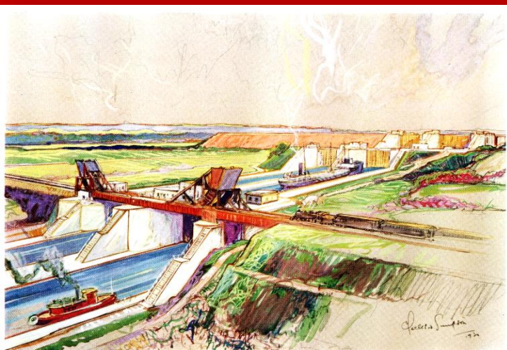
Welland Ship Canal—Twin Flight Locks at Thorold.